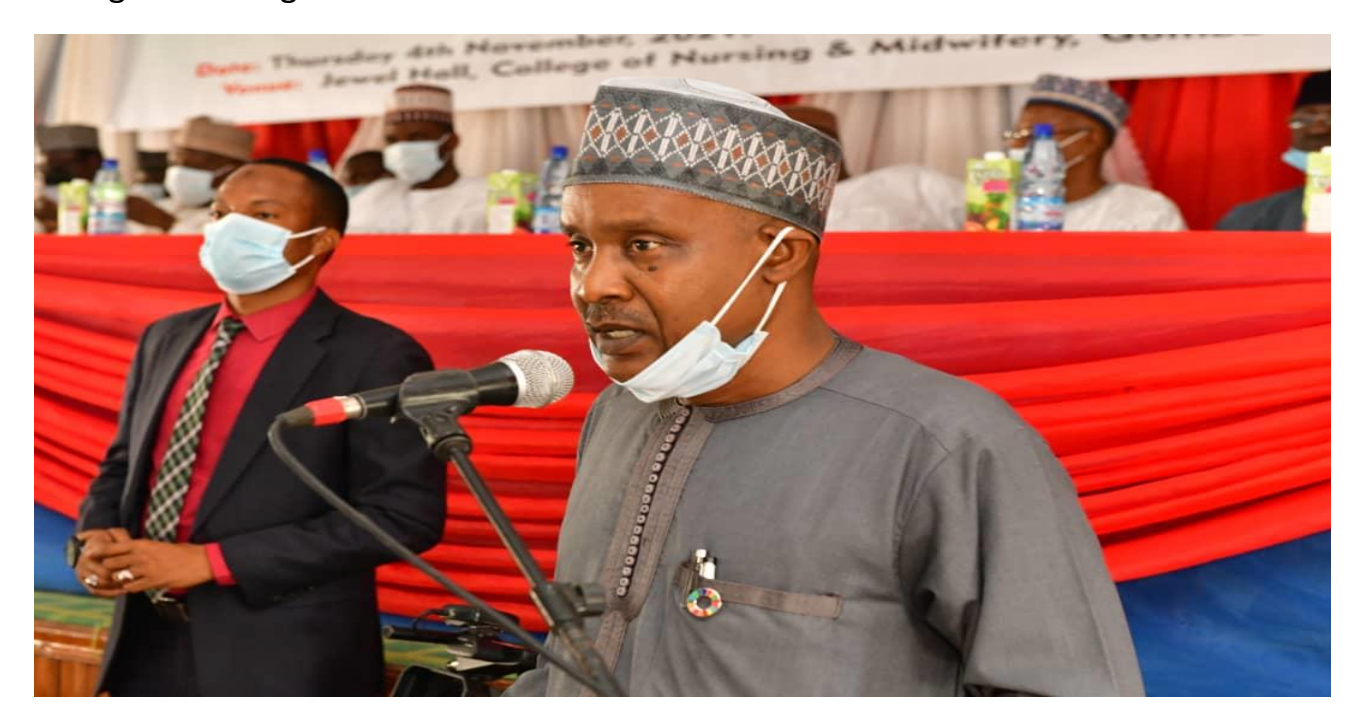
THE SPECIAL ADVISER MAKING HIS WELCOME ADDRESS

consultation meeting. He also welcomed all guests including representatives of the Civil Society, Royal fathers, Traditional and Religious leaders, Businessmen, Businesswomen and youth groups while wishing all a memorable and fruitful dialogue meeting.