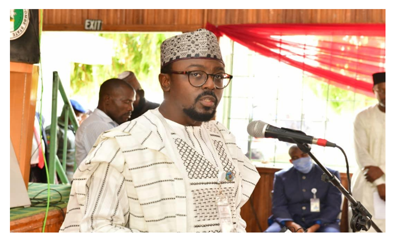
HON. COMMISSIONER OF FINANCE MAKING HIS SPEACH

This provision is talking about the preparation of Annual Budgets. As a new norm, it is expected that the citizens should actively participate and be involved in budget processes which has become a global best practice. He said that Budgets are tools that the government employs to drive economic policies aimed at uplifting the living standards of the society by mitigating disparity, providing infrastructure, Education, Health and Housing facilities. He therefore assures the participants that Gombe State government will give priority attention to the inputs made in this meeting with a view to ensuring that what people want is in the 2022 budget.