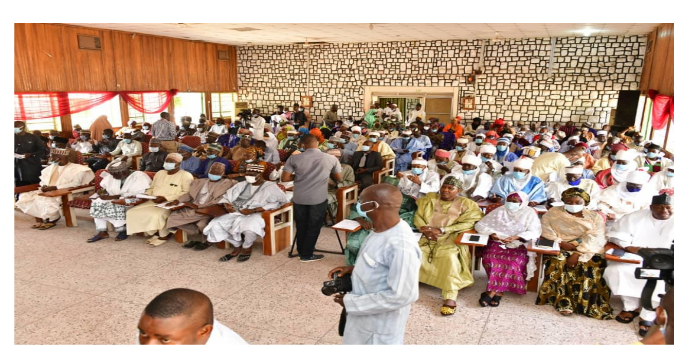
SECTION VIEW OF PARTICIPANTS