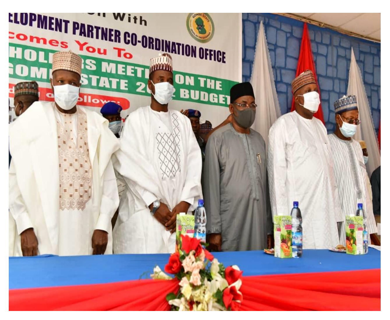
THE HIGH TABLE VIEW